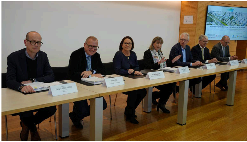
The signatories of the Nei Hollerich framework agreement.