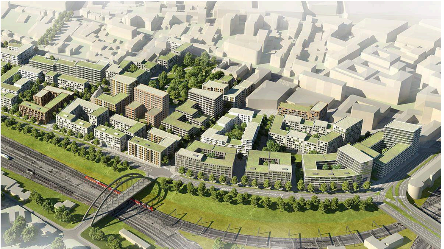
A view of what the future Nei Hollerich district could look like.

Nei Hollerich district will accommodate nearly 10,000 residents and workers between Luxembourg central station and Route d'Esch